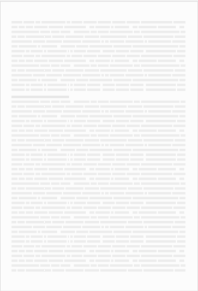
Dull; no focal points, no graphic structure